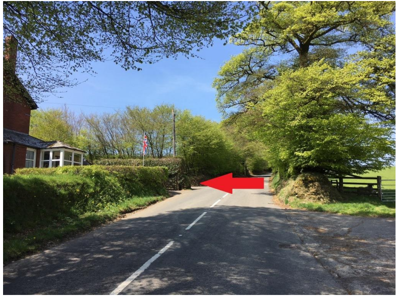
The Approach from Lynton and the North