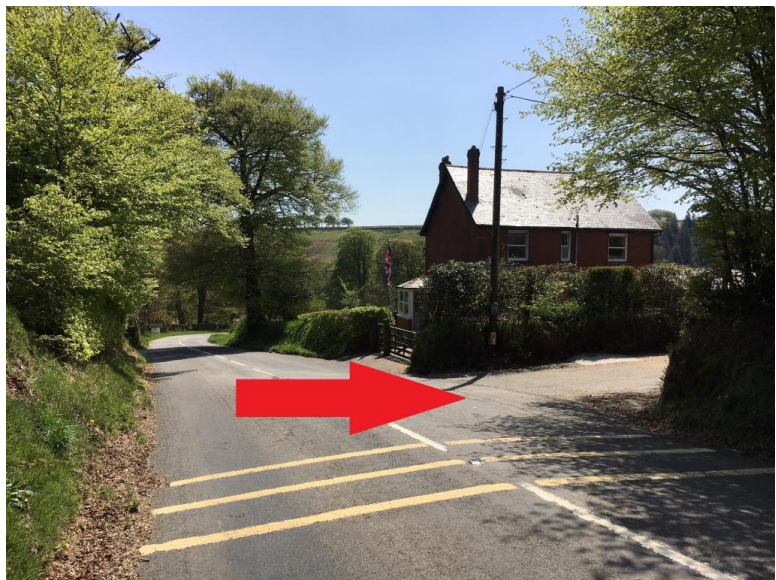
Turn into the Stable Yard